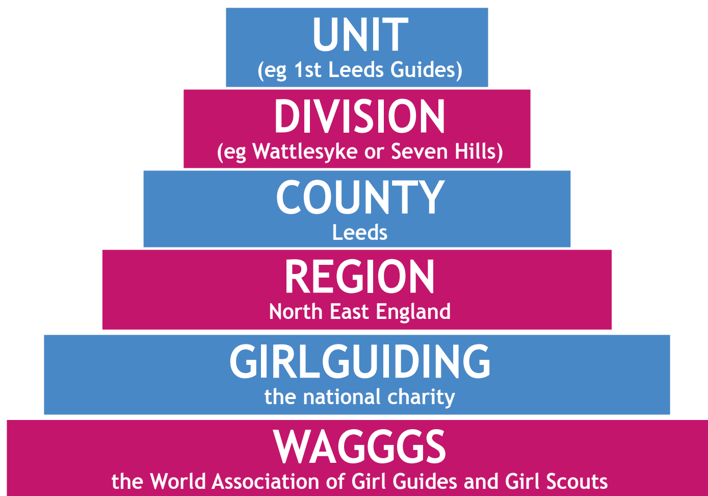
The structure of guiding.

Nationally, Girlguiding is run by a board of trustees led by the chief guide . There's a national staff team headed by our chief executive, who ensures the work undertaken by staff follows the direction agreed by the trustees.